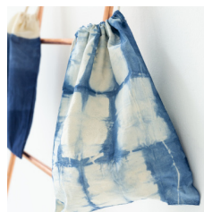
Tie Dye Bag