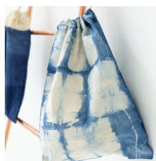
Tie Dye Bag